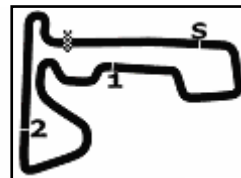
Franciacorta 2.519 m